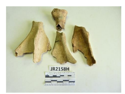
Figure 4. Butchered Swine Scapula, Layer H

For the swine scapula, Figures 4 and 5 show most of them were hacked through the glenoid and neck, or through the blade itself. The goal of these two cuts seems to have been to sever the shoulder from the front leg, and secondly to bisect the shoulder itself. Since the flat bone of the blade is so fragile, there were also many fragments possibly broken due to stress fractures. In addition to the hack marks, cuts made by knives were noted on scapula bones from Layers N and X.