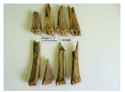
Figure 11. Butchered Deer Radius, Distal End/Shaft, Layer P