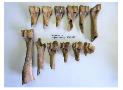
Figure 9. Butchered Deer Humerus, Distal End/Shaft, Layer P