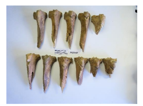
Figure 6. Butchered Deer Tibia, Proximal End/Shaft, Layer P