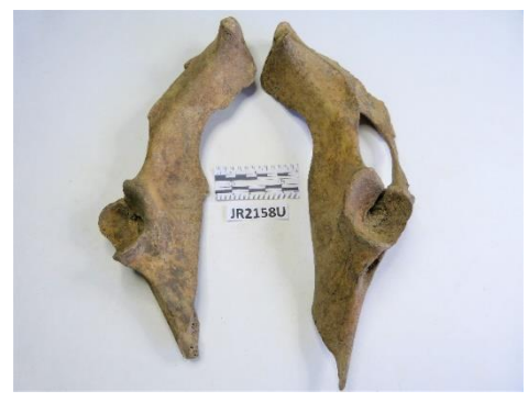
Figure 13. Butchered Deer Innominate, Layer U