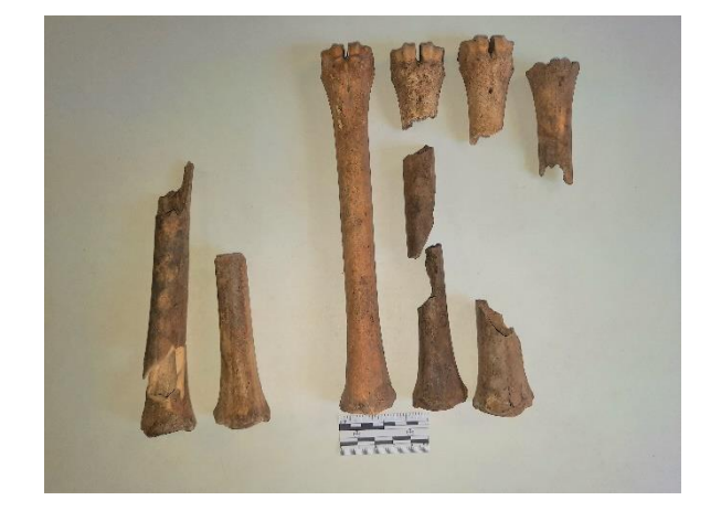
Figure 15. Deer Metacarpals, Layer N

In studies of meat and marrow yields for white-tailed deer bones, metacarpals and metatarsals rank the lowest in meat utility indexes. On marrow utility indexes, metatarsals typically rate the third or fourth most important element following the tibia, femur, and humerus. The metacarpal, on the other hand, ranks as one of the lowest producers of marrow (Jacobson 2000; Madrigal and Holt 2002). Knowing these elements were not productive for meat and varying in their importance for producing marrow, it is not clear why these elements are found in Layer N, and not in the other layers of the well. Could they represent a single hunting expedition where they brought back the complete body of the deer, as opposed to bringing back just parts of the animal butchered at the kill site? Could they represent a single trading expedition with local tribes, who kept the best parts of the animal for themselves? A more detailed analysis of the deer remains represented in the Second Well (JR2158) may provide some additional information on the dietary importance of deer in the diet and how the different elements may have ranked in their consumption.