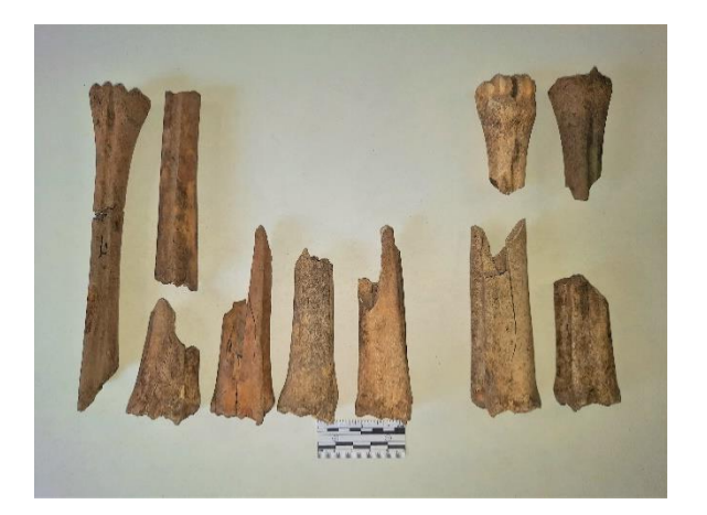
Figure 14. Deer Metatarsals, Layer N

When the deer remains from the Second Well (JR2158) are sorted by layer and then by individual element, there are some similarities and differences between the assemblages. As Table 33 shows, body elements were the most frequently identified deer remains, with vertebrae bones being the most numerous. Fragmented bones from the skull make up some of the highest NISP numbers for Layers P, U, X, and AA, while tooth fragments account for 14.9% of the deer elements from Layer H. Phalanges from the feet of deer are some of the most frequently identified elements from Layers H, N, and X. For the most part, all elements from deer are represented in each layer of the well with varying percentages. One noticeable exception to this is the category of metacarpals and metatarsals, which are bones making up the front and back lower legs of deer. These elements are nonexistent or are only represented by one or two bones in Layers H, P, U, X, and AA (highlighted in blue). However, in Layer N, these elements are present at least four adult deer (see Figures 14 and 15).