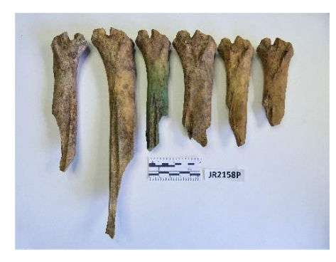
Figure 10. Butchered Deer Radius, Proximal End/Shaft, Layer P