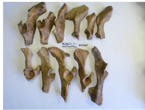
Figure 12. Butchered Deer Innominate, Layer P

Every layer from the Second Well (JR2158), with the exception of Layer AA, has butchered innominate bones. The butchered innominates include 5 cattle, 29 swine, 7 sheep/goat, and 47 deer bones (see Table 29). Like the scapula, the pelvic bones are vulnerable to breakage, and once butchered, its soft cancellous bone, covered by a thin layer of compact bone, makes it an easy target for dogs and feet. By viewing the deer innominates as a group (see Figures 12 and 13), it is clear the bones were typically butchered on the proximal end of the bone just above the acetabulum. For the domestic mammals, the cuts on the innominates were more varied with some on either side of the acetabulum, through the ilium, ischium, and sometimes the pubis. Cut marks made from a knife were also recorded on two of the deer innominate fragments from Layer U and from one deer innominate from Layer N.