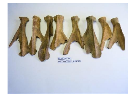
Figure 3. Butchered Deer Scapula, Layer U

For the swine scapula, Figures 4 and 5 show most of them were hacked through the glenoid and neck, or through the blade itself. The goal of these two cuts seems to have been to sever the shoulder from the front leg, and secondly to bisect the shoulder itself. Since the flat bone of the blade is so fragile, there were also many fragments possibly broken due to stress fractures. In addition to the hack marks, cuts made by knives were noted on scapula bones from Layers N and X.