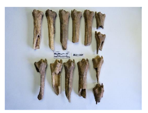
Figure 7. Butchered Deer Tibia, Distal End/Shaft, Layer P