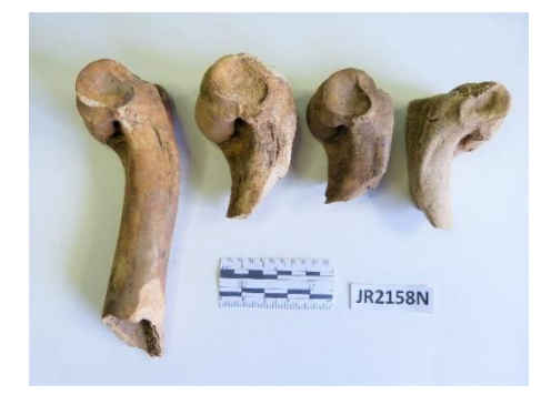
Figure 8. Butchered Deer Humerus, Distal End/Shaft, Layer N