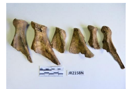
Figure 5. Butchered Swine Scapula, Layer N